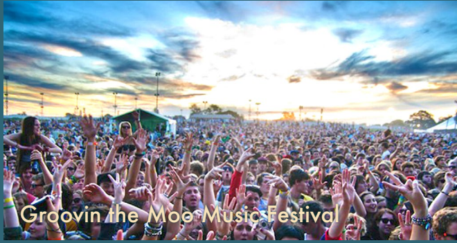
Groovin the Moo Music Festival